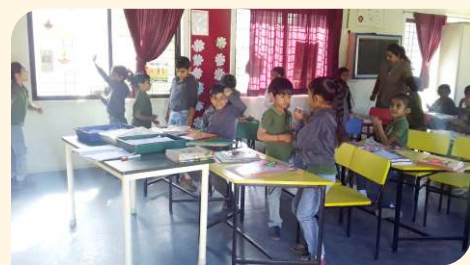
Learning Action Words