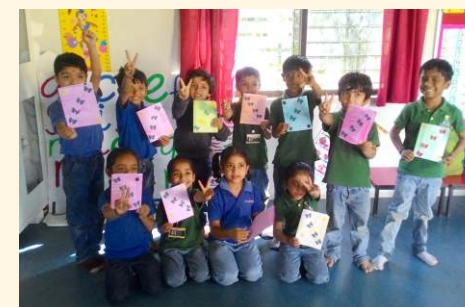
Creating Cards for their parents on Christmas