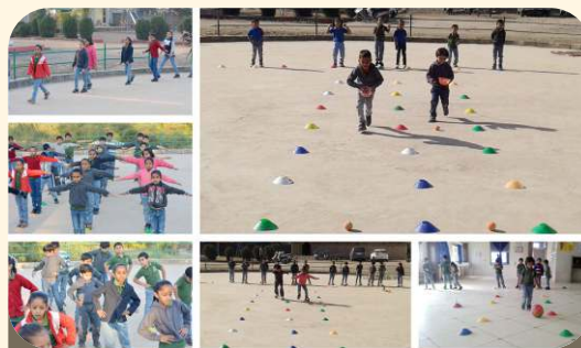
JIO Demonstration given by an expert