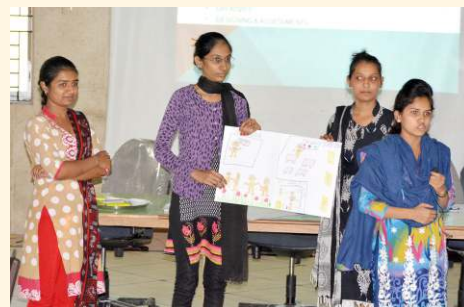
All set to spill the study