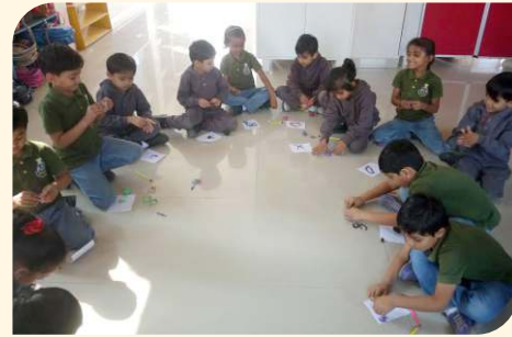
Carry on with Clay

Activity of Gujarati vyanjan conducted by Dhara ma'am in grade 1. As Gujarati included from grade 1 children need to learn curves of Gujarati letters. So for that here children are making all the letters with clay. It also helps to develop their fine motor skill. Children enjoyed a lot by playing with clay.