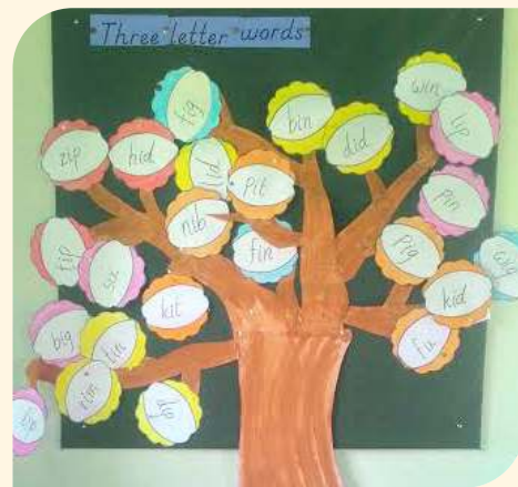
Creative task by Champs

Activity under transportation topic covered by Riddhi ma'am in K1. Under this topic they learned land & air transportation & made a small model of land transportation. So they could get the idea about different means of transportation. They eagerly participated in this activity & their response was marvelous.