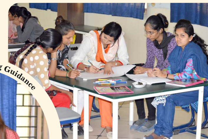
Applying thought process