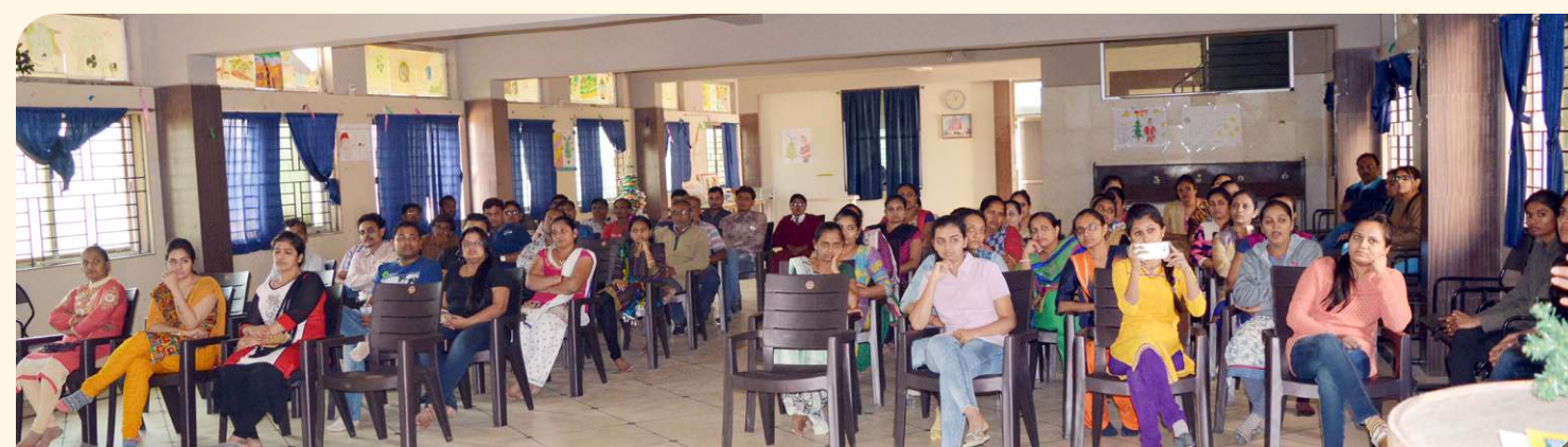
We are ready... Are you ??