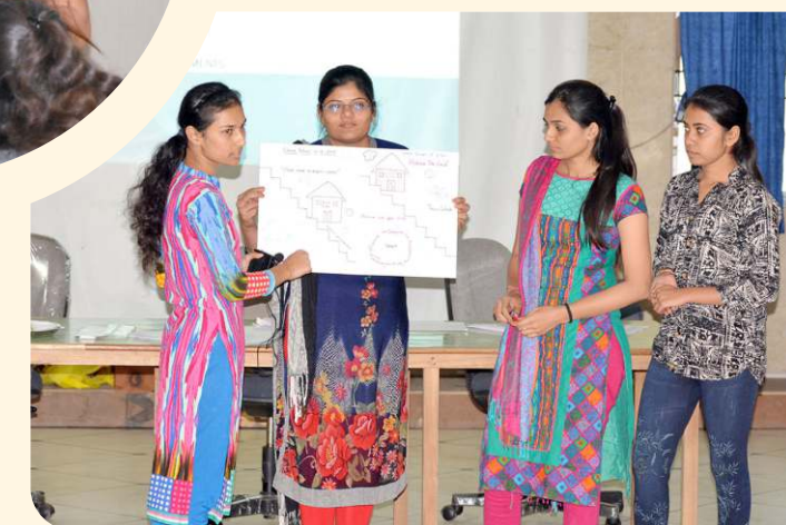
Let me show you my way of thinking