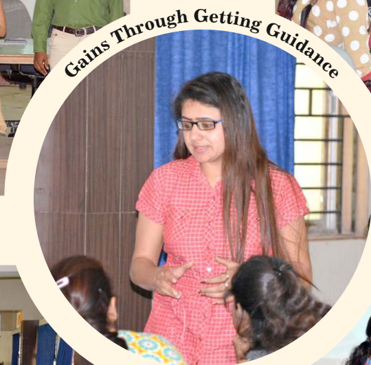
Gains Through Getting Guidance