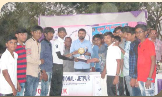
The harder the conflict, the more glorious the triumph

J etpur Sports Week was celebrated by Jetpur Sports Association from 25th to 31st December, 2016. In this event, the students of all schools of Jetpur participated enthusiastically. Many events were there like cricket, chess, badminton, 100 m & 200 m race, tug of war etc. In this event, the pupils of SGOS also participated and won some titles..