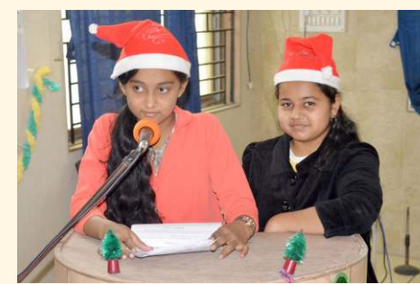
The Enthusiastic Anchors