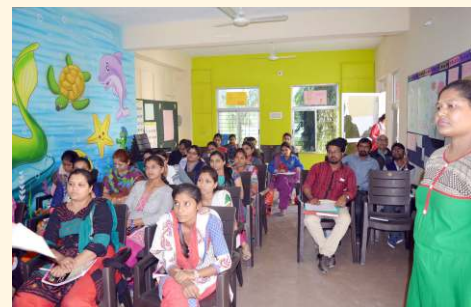
Immersed in the class