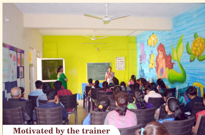
Motivated by the trainer

It's really very astonishing and challenging for me when I was selected as a resource person for training of my own colleagues. But I can feel within me the change after taking these sessions. It was a boost to my teaching skills and confidence.