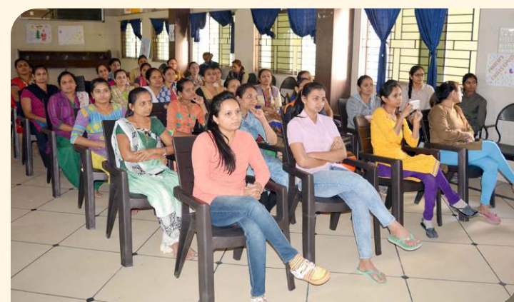
Let's Move Together