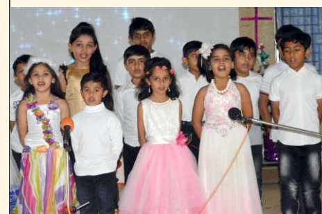
Love to Sing