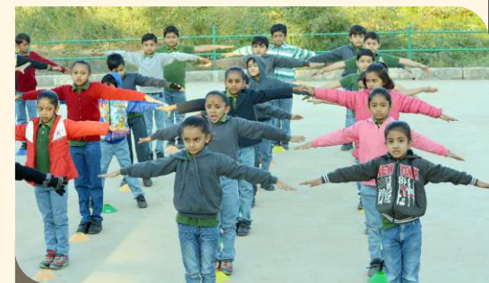
JIO Demonstration given by an expert