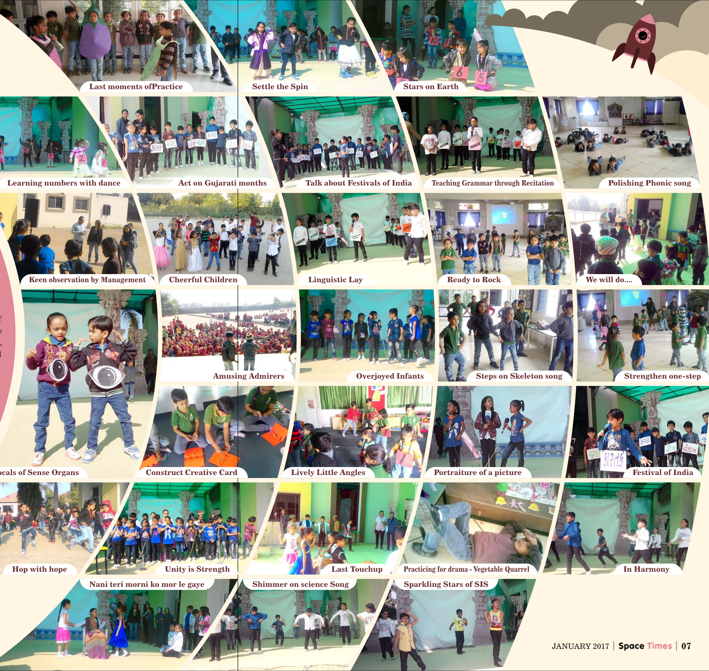
Last moments of Practice