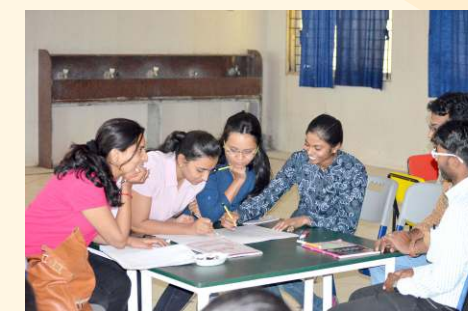
Sharing and Enjoying