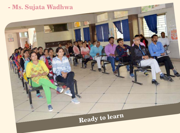
Ready to learn