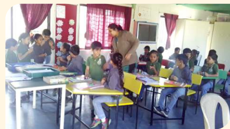
Let's learn Together

This play - learn method of ABL was organised by Chhaya Bhanushali for Grade 1 & 2 students on the topic Verb of Grammar . All the students willingly participate in this activity & learnt a lot with enjoyment & fun. All the students enacted different action words & other partner guess the action.