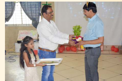
Welcoming the Guest of Honour