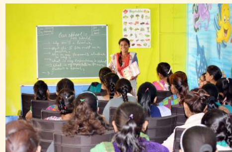
Sharing her ideas