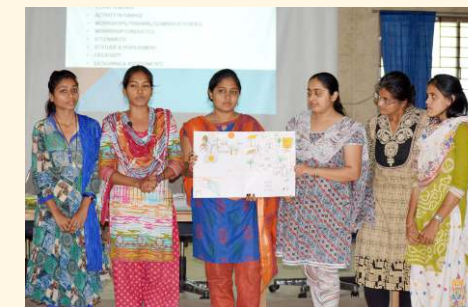
We are all set to express !!