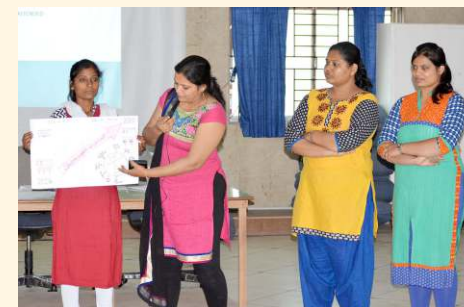
Communicating the Cognitive outcome