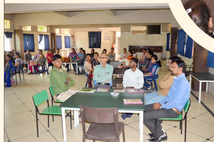
Longing to Learn