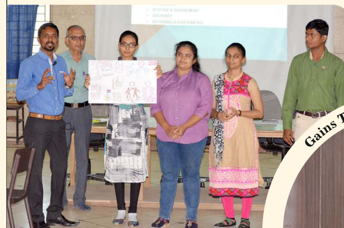
Showcasing the ideas through poster