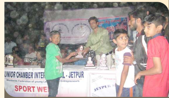
The harder the conflict, the more glorious the triumph

J etpur Sports Week was celebrated by Jetpur Sports Association from 25th to 31st December, 2016. In this event, the students of all schools of Jetpur participated enthusiastically. Many events were there like cricket, chess, badminton, 100 m & 200 m race, tug of war etc. In this event, the pupils of SGOS also participated and won some titles..