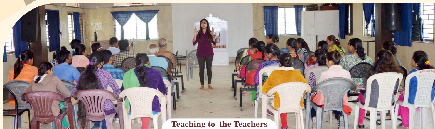
Teaching to the Teachers