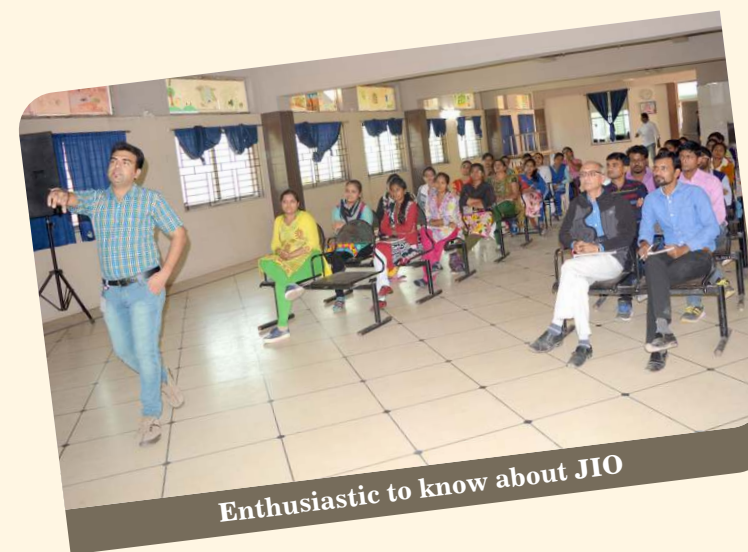
Enthusiastic to know about JIO