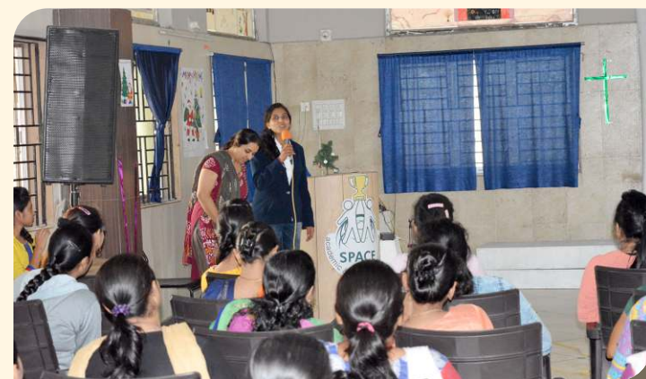
Explaining the syllabus and its scope to parents