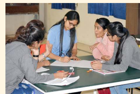
Being Engrossed - Don't Disturb....