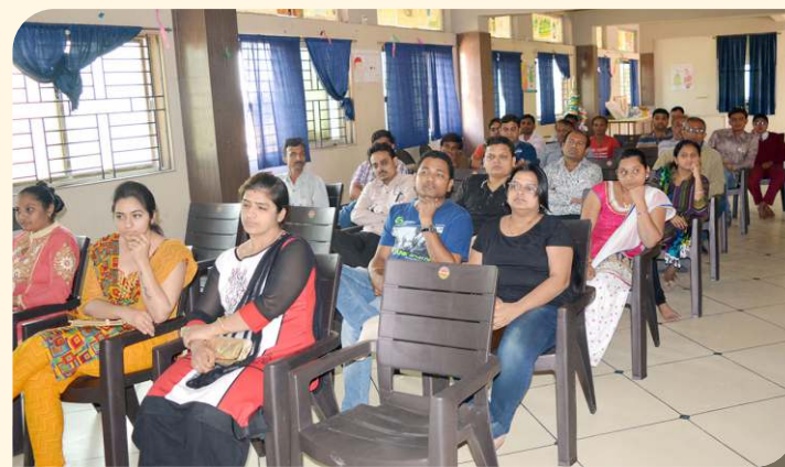
Keen to know the upcoming events in SIS