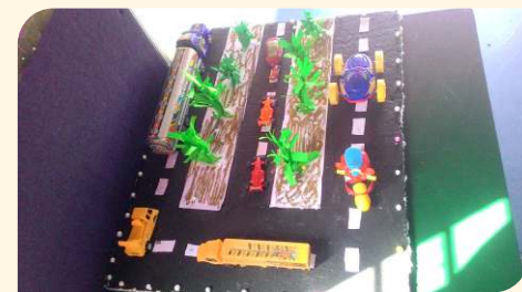
Model of Road transportation