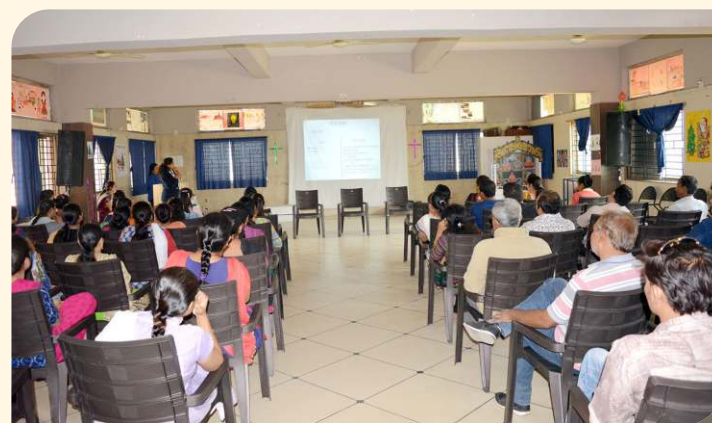
Parents attended the Orientation