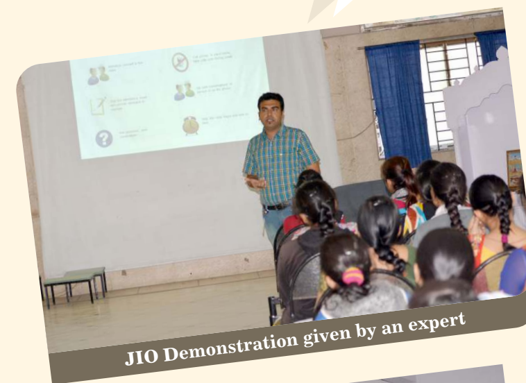
JIO Demonstration given by an expert